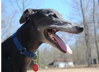
Mr. Ro poses. A most regal male, Ro is home-ready!