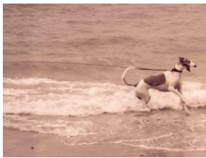
Belle loves the beach!

Its time! Register to attend Sandy Paws 2008 at Jekyll Island Oceanfront Resort. Options to staying at the resort include a fully equipped campground as well as other lodging on or near the Island. The event is an opportunity to have fun with your greyhounds at a beachside location and offers seminars, vendors, parades, prizes and even a Friday night Beach Paw-ty! Register online now for this important event at www.sandypaws.org . See you at the beach!!